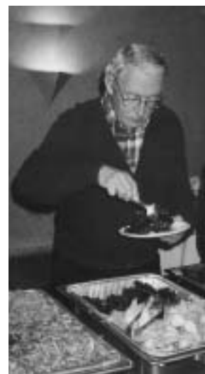
Pictured above: Touro member digs in to the buffet at this past January's meeting at the Islander Restaurant.